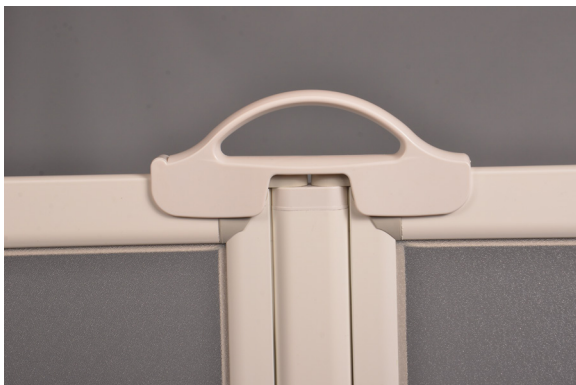
A hinged handle spans each hinge joint to hold the caregiver door straight while in the closed position.