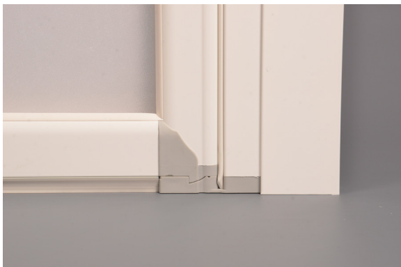
A riser mechanism raises each door pair slightly off the floor as it swings open, either inward or outward.